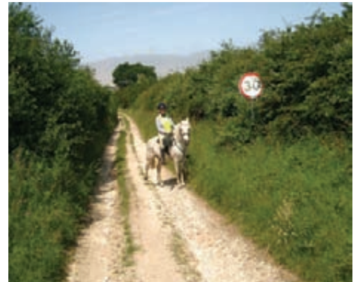
Riding on an unclassified road

Unclassified roads (UCRs) were not to be included on the definitive map under the National Parks and Access to the Countryside 1949 Act, which only applied to footpaths and bridleways, and roads used as public paths. However, since that time a significant number of UCRs have been recorded as BOATs (reflecting their vehicular status) or as bridleways or footpaths, in which case they are described as having dual status, with the higher status prevailing. However, a large number of UCRs are still only recorded on the list of streets (LoS) or highway register, the local authority record of all publicly maintainable highways.