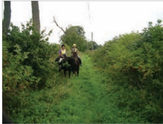
An unrecorded hedged lane

In 2002 the Countryside Agency estimated that there were some 20,000 unrecorded rights of way – totalling 16,000 km – in England. These were broken down as follows: