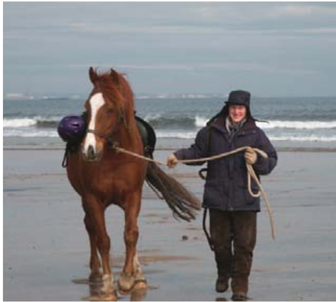
Winter's day on the foreshore, Seaton Carew, Hartlepool