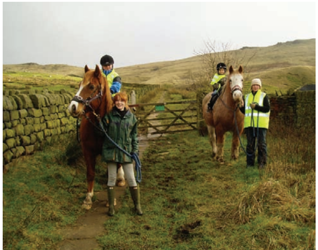
Ancient highway crossing urban common: bridleway to gate, footpath thereafter

Clearly, any policy changes to Natural England's management approach could have a severe impact on the quantity and quality of equestrian access. Any undefined access needs to be properly addressed as it is constantly being challenged. In addition, the introduction of conservation grazing schemes is resulting in the fencing of many open and uninclosed commons, often with the result that horse riders are being excluded from those commons where they have a statutory right to ride.