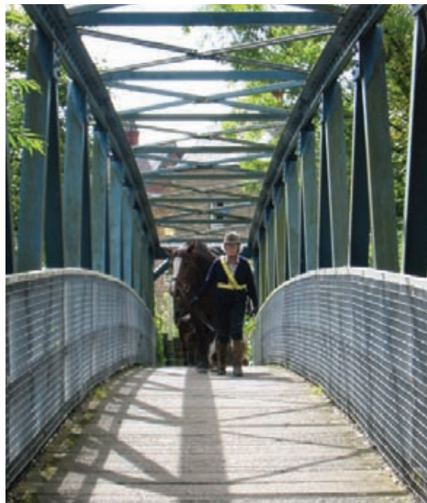
Crossing an urban bridge

Use of GIS for Road Length Data – Further Information 7