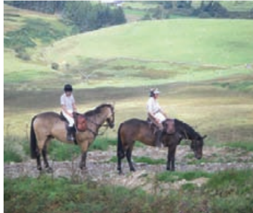
Exploring open land

51 Commons registers and the accompanying maps are held by the land charges section of the local authority and are available for public inspection.