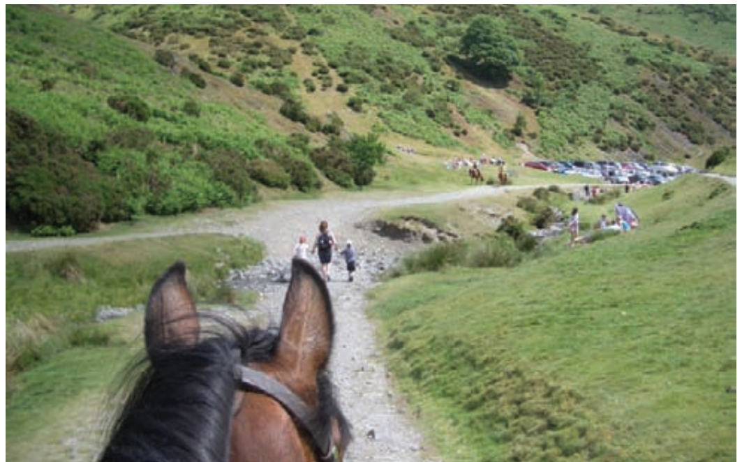
Riding through the car park at Stretton Hills, Church Stretton, Shropshire

The only way to tackle the problem is an independent scrutiny of highway authorities' performance. This need to be done by a body, acting on behalf of the public, with specialist knowledge of public rights of way administration, and a remit to secure improvements in the performance of failing authorities.