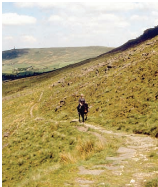
Salter Rake Gate, Langfield Common, Todmorden. Part of a Saxon salt road, now used by the Pennine Bridleway Mary Towneley Loop