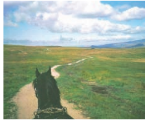
Gorbeck Road, now part of the Pennine Bridleway, crossing Marsden Moor

Prior to the passing of the Law of Property Act in 1925, many commons in rural districts were still widely regarded as part of the uninclosed waste of the manor, and the beaten tracks that crossed them were presumed to be rights of way open to all. Although the public's right to roam over rural common was removed by the 1925 Act in the interests of game shooting, the public rights of way across the land remained. However, subsequently, due to the inadequacies of the definitive map process, many of these paths have not been properly recorded and, as a consequence, are no longer available to horse riders. The same applies to former rural and urban commons that were withdrawn from the 1965 register because no rights of common were found to exist over them at that time.