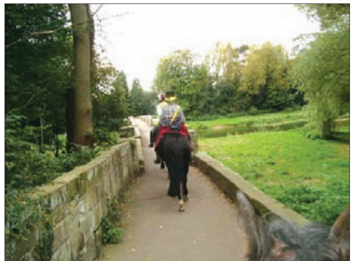
Safe off-road access

The Strategy for the Horse Industry in England and Wales , published in December 2005, identified the need to increase access to off-road riding and carriage driving as one of its main aims. In the following chapters we examine how this could be done.