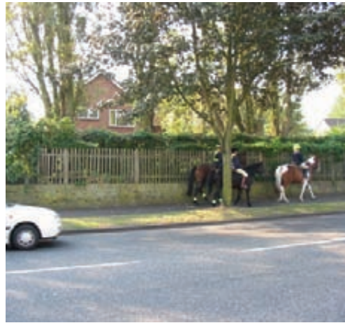
Life saving but illegal. Riders use the pavement to get away from traffic

Horse riders are classed as vulnerable users, along with motorcyclists, cyclists and pedestrians. Approximately 3,000 road accidents reported each year involve horses, of which an average of 142 include personal injury. 11 In 1992 an estimated 29 accidents a day involved horses and 71 involved cyclists. 12 However, the number of recorded accidents is thought to be a gross underestimate – many injuries or near misses are never reported. Many riders and carriage drivers are afraid to ride down motor roads to get to their nearest bridleway, such is the increase in traffic. It is therefore important that safe off-road links are established to join up the existing equestrian rights of way network. Safer routes for equestrians also means safer routes for walkers and cyclists.