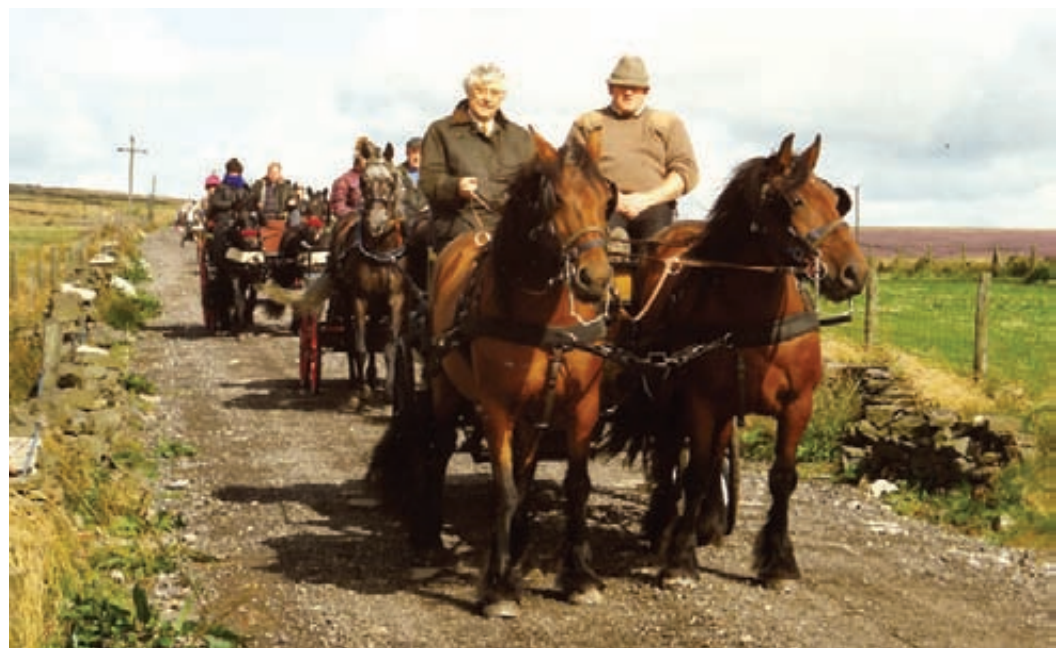
The late Sir Donald Thompson, when he was Calder Valley MP, leads the Calder Valley Driving Club on a newly restored inclosure private carriage road set out in 1816

'Horseriders are particularly vulnerable road users, and cycle routes can provide appropriate and important opportunities to avoid busy roads. There is potential for conflict in any situation where people share a public space, but the possibility of conflict is not reason enough to disregard ridden access; actual conflict could be resolved and any misplaced concerns reduced over time.'